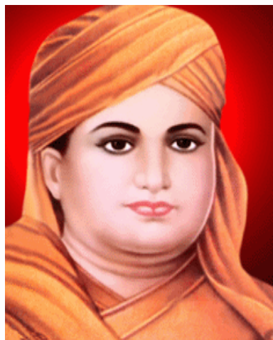
Swami Dayanand Saraswati Ji The Founder of Arya Samaj