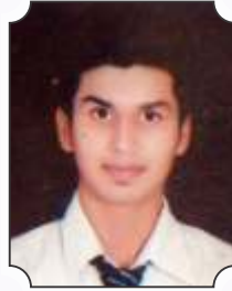
Akshun Gold in GNDU (Badminton)