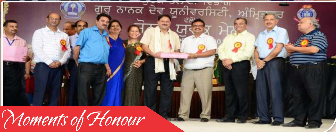
Moments of Honour