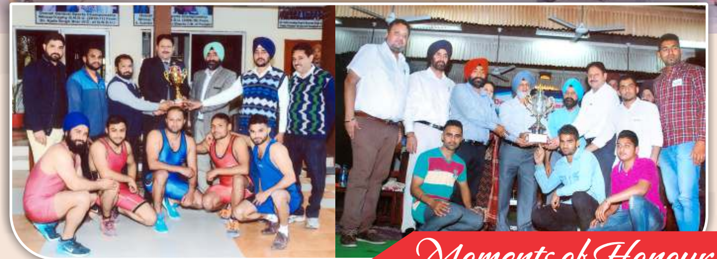
Moments of Honour