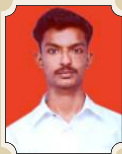
Shubkiran Folk Orchestra